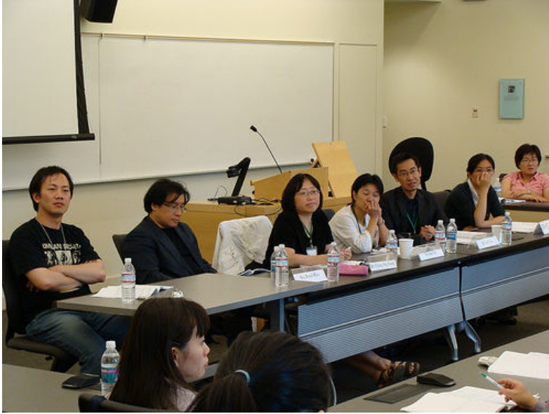
* Roundtable Discussion.