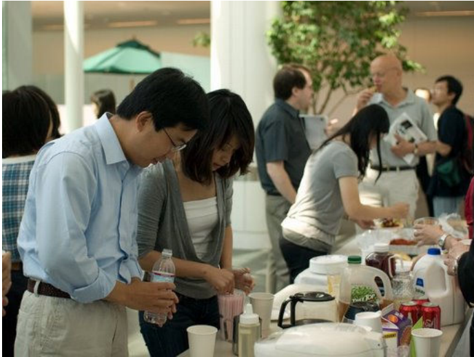
* Refreshments during breaks.