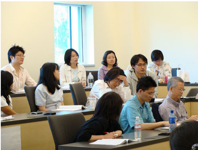
* Q & A during the Roundtable Discussion.