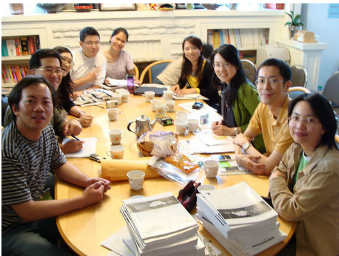
* Preparatory meeting at the Taiwan Center of Seattle.